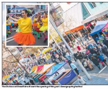
The Outdoors of Street Fair is the start of the parade of this year's Emerge at the George Stage.