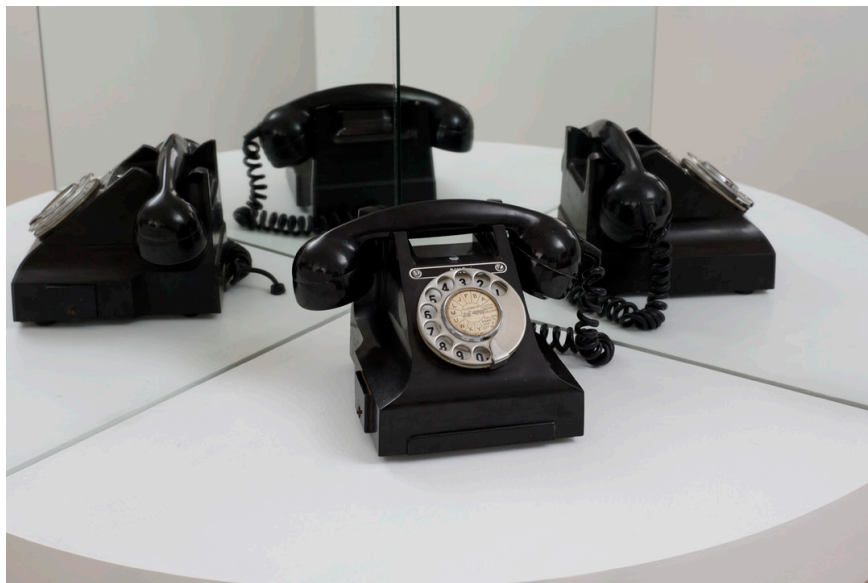
Robyn Backen A very enchanting thing 2007, mirror, Bakelite telephone, sound, wood, electronics 204 x 55.5 x 55.5 cm.

Visit www.twma.com.au for program of performances during the exhibition